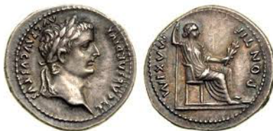
DENARIUS OF THE EMPEROR TIBERIUS

In Matthew, Jesus is shown teaching in the Temple in 21:23-22:46. There are really two parts of which our reading opens the second part, 22:15-46. The purpose of this section seems to be to expose the inadequacy of the teachers of Israel. Pharisees and Sadducees are profiled in futile disputes intended to trip