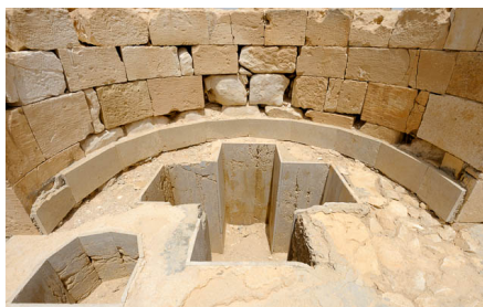
Cross-shaped baptismal font in the Nabatean city of Avdat (Israel)

The context here remains that of conflict between Christ believers of Jewish and Gentile origin. Paul's goal in Romans 1-4 was to show their equal "success" in sinning and their equal need of faith